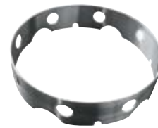
Wok Ring 3389