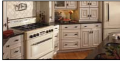
The Legend Collection