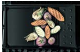
Griddle Kit AG-P028773