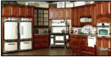
The Classic Collection

See more at www.heartlandapp.com or a dealer near you.